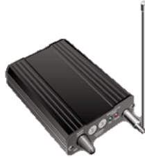
Sample of Applied Wireless transmitter

Parish Hall without incurring a major expense. The solution came in the form of an Applied Wireless transmitter and receiver for around $450 with a range of 750 feet.